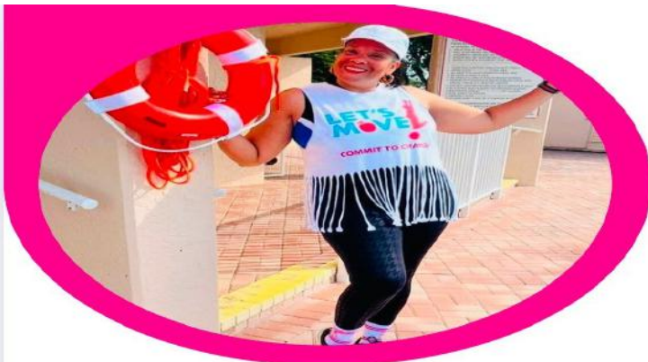
DNA TOTAL FITNESS AIDA