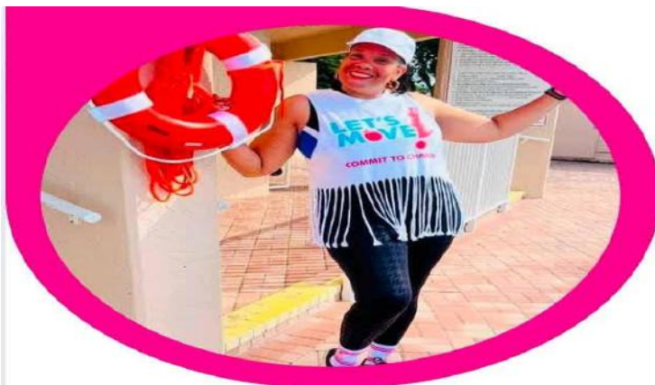
DNA TOTAL FITNESS AIDA