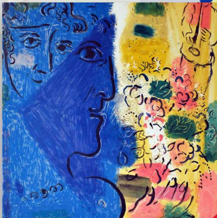
Blue Yellow Composition: Head and Flowers