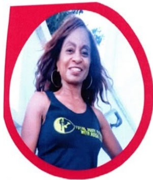
TOTAL BODY FITNESS ROSA